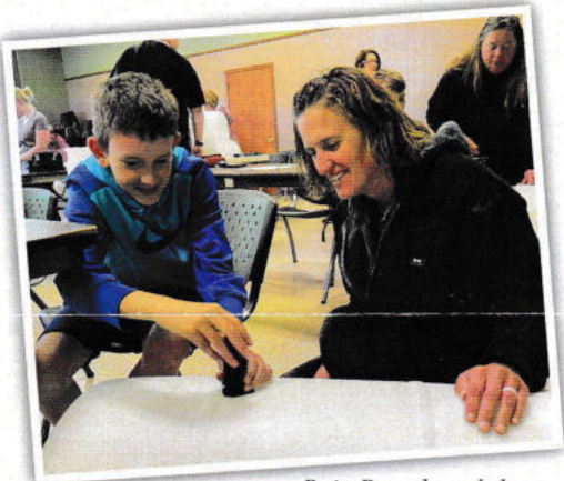
Rain Barrel workshop

Please consider becoming a member of the Eden Legacy Society and join other community friends and neighbors in ensuring that the Eden Community Foundation has a long and successful future. The Eden Legacy Society recognizes those individuals who have remembered the Foundation with a bequest or other legacy gift. For more information, please contact the Foundation at (716) 992-4799 or edencommunityfoundation@gmail.com .