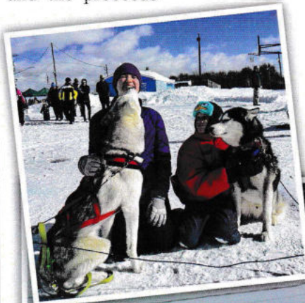
Sled Dog demonstration at Eden Winter Fest